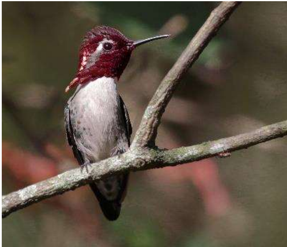
Bee Hummingbird