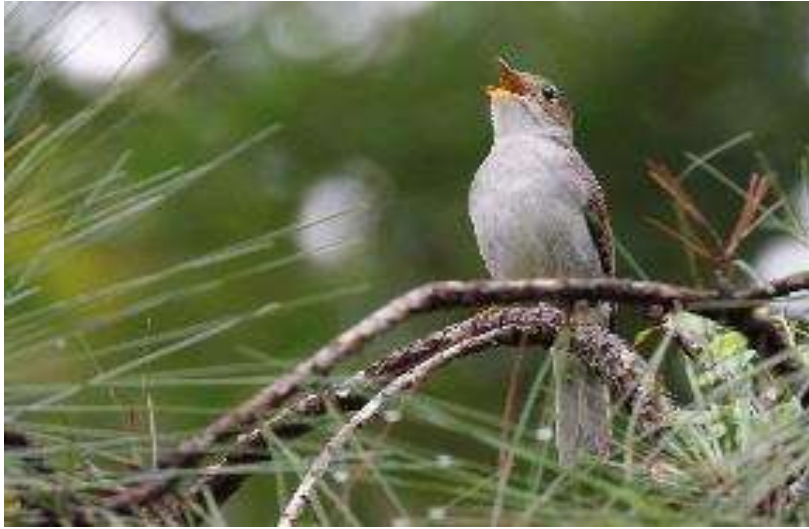
Cuban Solitaire

April 1, Day 10: From Soroa to Havana. Visit Las Terrazas community. Today will be a day filled with cultural and nature experiences. Prior to breakfast we will work the surroundings of our accommodations where Great Lizard-Cuckoo, Cuban Emerald, Antillean Palm-Swift, Loggerhead Kingbird, Greater Antillean Grackle, and Cuban Oriole abound. Not far from Soroa and also in the mountains of the Sierra Del Rosario Biosphere Reserve is the planned eco-community of Las Terrazas, where we learn about life there from local residents and how the entire region was re-forested. Here, we may have a chance to taste a superb Cuban coffee.