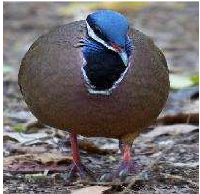
Blue-headed Quail-Dove

NIGHT: Private Accommodations in Soroa, Artemisa