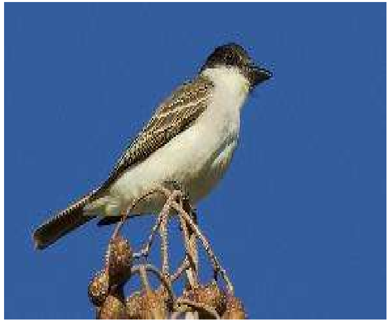
Giant Kingbird

An early morning departure to the valleys surrounding Sierra de Najasa will give us a good opportunity to look for two of the most restricted distribution Cuban endemics; the Giant Kingbird and the Cuban Palm Crow. Both species are rare elsewhere, thus our efforts will focus on finding these species. One should notice that the Cuban Palm Crow and the Cuban Crow both occur in this part of the island making voice, wing beat and behavior the key for reliable identification of either one. Other species we should see include Cuban Parrot and Plain Pigeon.