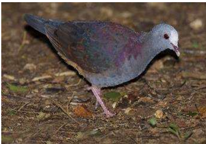
Gray-fronted Quail-Dove © D. Ascanio

March 28, Day 6: Parque el Cubano, Bermeja and the Bay of Pigs. An optional early morning field trip will find us at the entrance of the small Parque el Cubano just outside of Trinidad where we may be rewarded with sightings of more endemic birds, namely the Cuban Pygmy-Owl, Cuban Vireo and Cuban Green Woodpecker. The park itself protects some good tracks of tropical dry forest and our visit might be rewarded with other species such as the Cuban Bullfinch, the more widespread Yellow-faced Grassquit and even a Limpkin.