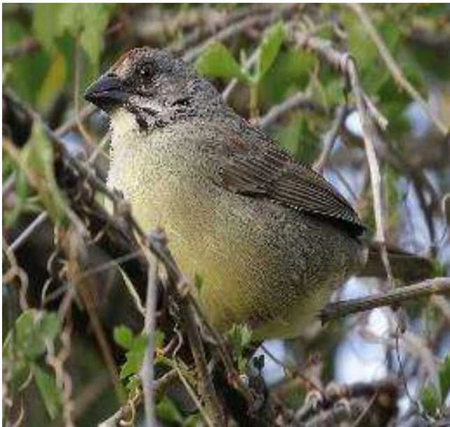
Zapata Sparrow

you can be sure there are important birds associated with each of these habitats! Here we will have the opportunity to join a local ornithologist to learn about Cuba's conservation challenges and achievements. An early morning departure to Cayo Paredón Grande will offer opportunities to look for the secretive Cuban Gnatcatcher and the brightly colored Western Spindalis. We will also look for the amazing Zapata Sparrow, the unique Great Lizard-Cuckoo, the astonishing Cuban Green Woodpecker and many more. Toward the end of the morning, we will look for the rare and range-restricted Bahama Mockingbird while searching out other island endemics such as Cuban Black Hawk and Oriente Warbler.