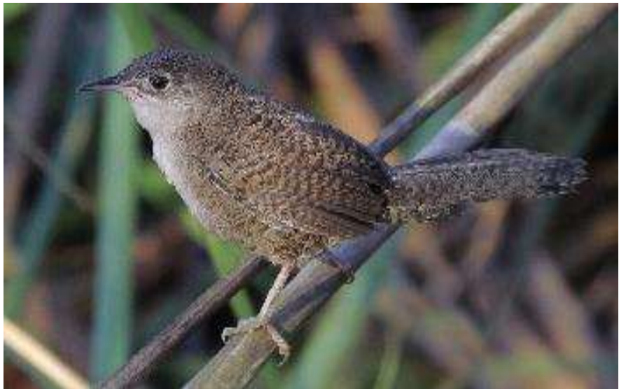
Zapata Wren © D. Ascanio